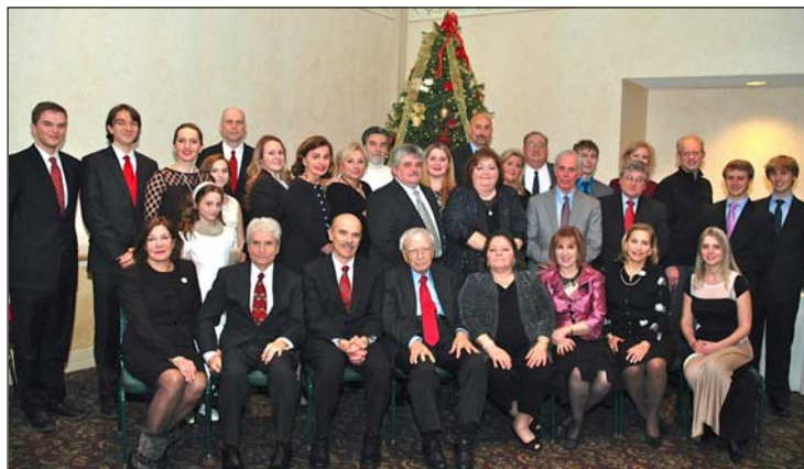
UMANA Michigan Branch members and families at Yalynka

February 1, 2014 – Traditional Debutante Ball with the presentation of 6 debutantes, Palmer House Hilton, Chicago, Illinois.