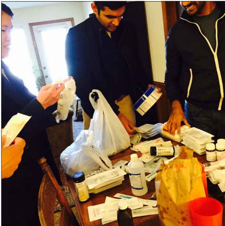
Texas Tech medical and pharmacy students organize and take inventory of the supplies.