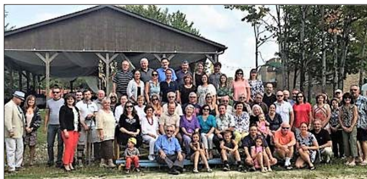
Ohio branch members gather for picnic festivities.