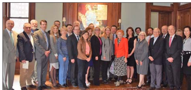
UMANA members greet Dr. Ulana Suprun, Acting Minister of Health of Ukraine.