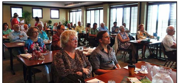
Conference attendees absorb a morning lecture on "Safe and Healthy Travel".

The evening continued with a pleasant meal and concluded with extended conversations and reminiscences among the many colleagues from throughout the country. With the weather continuing to improve, some attendees reluctantly began preparations to depart on Sunday, while others had the foresight to extend their stay a few more days. Members began discussing plans for the upcoming conference in two years. Though the exact location and topic are still undecided, UMANA hopes to repeat this experience with an equally informative and relaxing convention in 2015. You can view a slide show of the conference at www.umana.org .