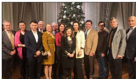
NY Metro Branch Christmas Yalyinka