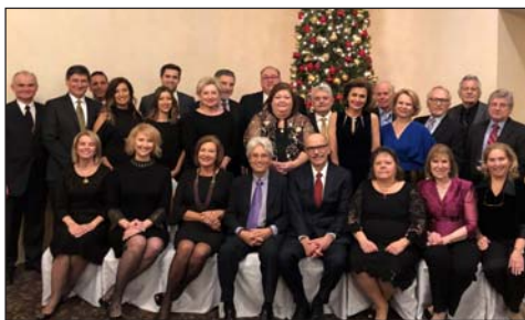
Michigan Branch Christmas party

The UMANA Pennsylvania Chapter members enjoyably participated in the Banquet and Ball with Presentation of Debutantes held by the Ukrainian Engineers Society of America in Philadelphia on February 2, 2019, at the landmark Hotel Bellevue in historic downtown. Members enjoyed a magical evening in an unforgettable setting, with colleagues, family, and guests meeting the Philadelphia area debutantes.