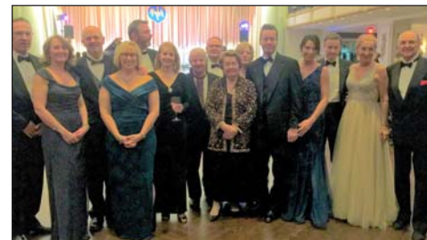
Pennsylvania Branch members at UESA Ball