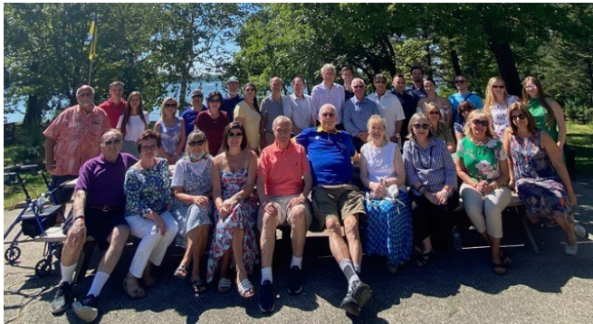
Illinois Branch Picnic