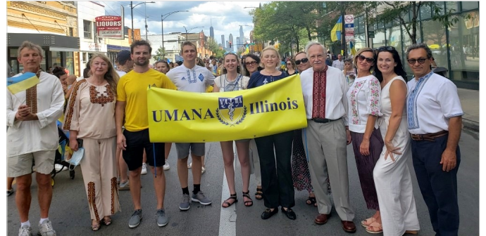
Illinois Branch marchers

to celebrate the 30th Anniversary of renewed Independence of Ukraine. Though the weather was extremely hot and humid, a slight breeze and the uplifting spirit of the day kept everyone in good cheer.