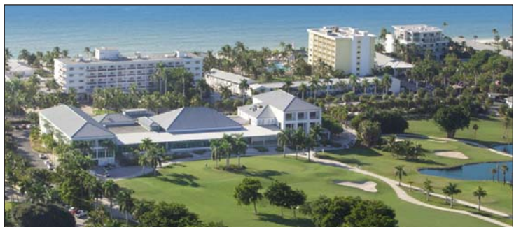
Naples Hotel and Beach Club

UMANA will hold its 42<sup>nd</sup> Scientific Convention and 35<sup>th</sup> Assembly of Delegates at the Naples Beach Hotel and Golf Club in Naples, Florida, June 6-9, 2013. UMANA, in conjunction with the Chicago Medical Society, will present a seminar on " Safe and Healthy Travel ", educating health practitioners in the nuances of various medical aspects of touring and voyaging.