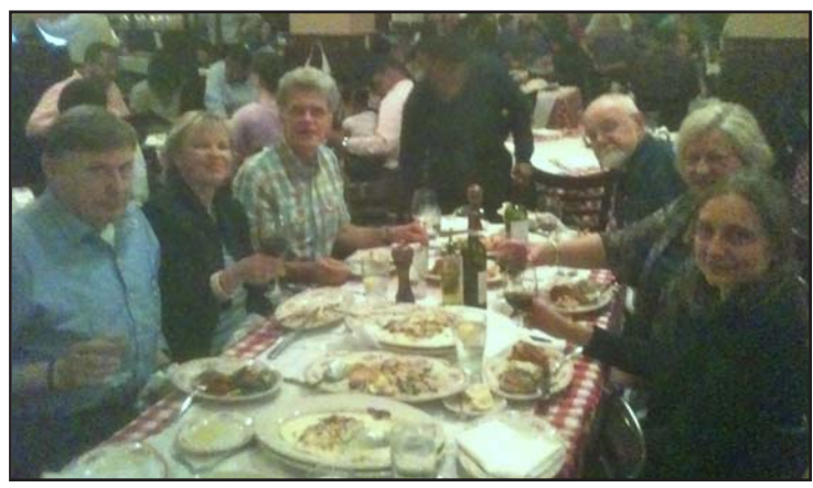
Maryland-DC Metro Branch

The Maryland-DC Metro branch held a regular meeting at Maggianno's on Saturday, May, 11, 2013, to celebrate collaborative accomplishments and to plan for the chapter's next steps.