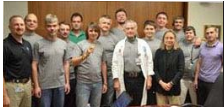
WFUMA-U.S. ATLS course at Tulane University

JUNE 18-21, 2015 "WELLNESS MEDICINE" XLIII Scientific Conference XXXVI Assembly of Delegates