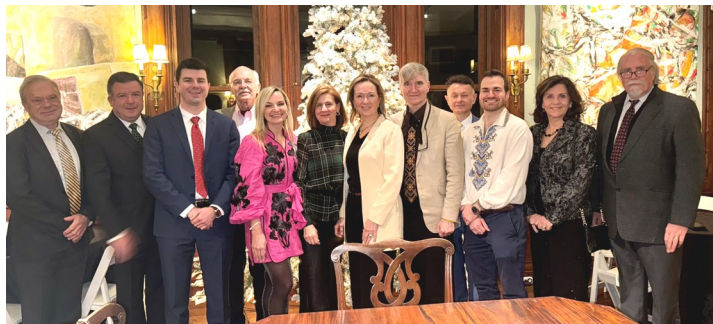
New York Metro Branch members at their Yalynka

The Ukrainian Medical Association of North America