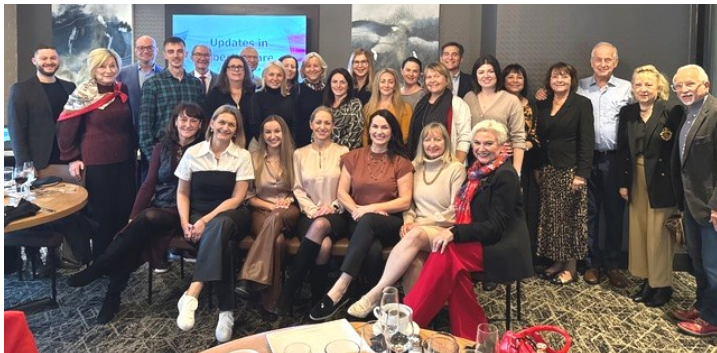
Illinois Branch members at Cooper’s Hawk