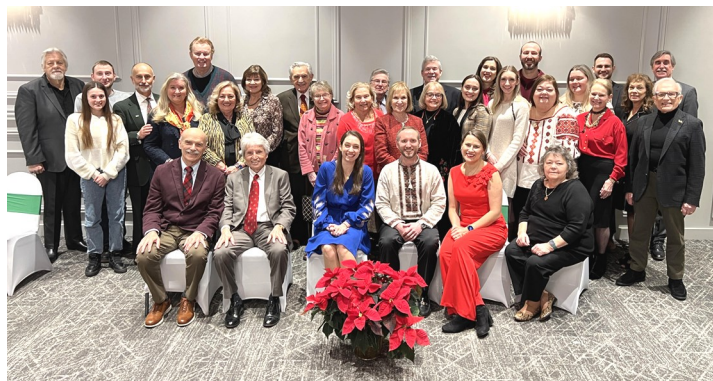
Michigan Branch members at Carpe Diem